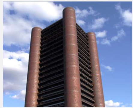
OUR CODE OF ETHICS AND CONDUCT